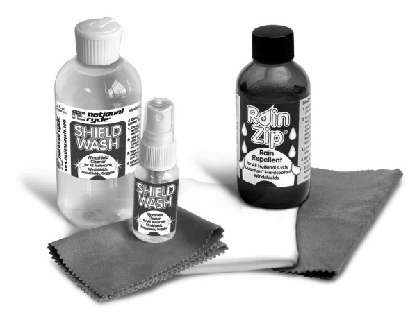
Ask for Shield Wash™ and RainZip® at your local dealer or visit www.nationalcvcle.com.